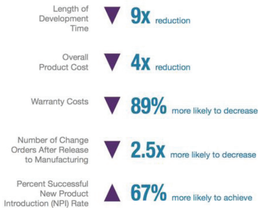
Figure 1. The Aberdeen Group reports that engineering simulation is critical to designing smart connected products

In achieving these goals, which often conflict with one another, product developers must make a series of complex trade-offs. For example, adding functionality may mean new electronic components — but will that make the product larger or heavier? Will it affect energy efficiency? Will thermal buildup become an issue?