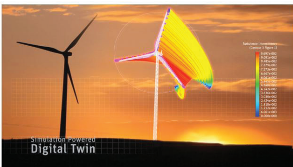
Figure 3. Simulation enabled digital twins can deliver business value through predictive maintenance, lifing, and future product innovation

As just one example, a leading aerospace and defense firm leveraged ANSYS software to simulate harsh environmental conditions, including vibration, to eliminate expensive and time-consuming physical testing. As a result, the company was able to save over $1 million by reducing the development time, eliminating consultant fees and cutting physical testing costs.