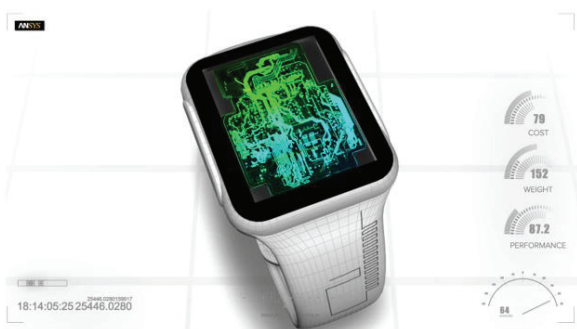
Figure 2. Whether designing antennas, circuits, or printed-circuit-boards, engineering simulation can provide greater insights over build-and-test methods

Antennas are central to the reliable, consistent performance of wireless systems. However, antennas can behave very differently in the real world when compared with the prototype testing environment of an anechoic chamber. Complex real-world structures, the movement of devices in which antennas are installed, and even human beings can cause a number of problems, ranging from multipath signal propagation to fading. To add even greater complexity, modern devices use multiple wireless technologies and frequency bands, requiring multiple antennas. The resulting antenna coupling and co-site issues can significantly degrade performance. Consider a scenario where a wireless sensor network is deployed in a factory. Each sensor uses a dipole antenna to communicate with other sensors. When a dipole antenna is deployed in an industrial setting, the complex structures and the interference from other antennas distort its radiation pattern — reducing antenna efficiency, increasing power consumption and leading to unreliable performance and even failure.