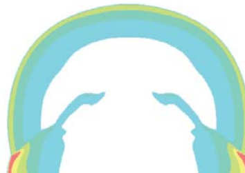
Target Perforation