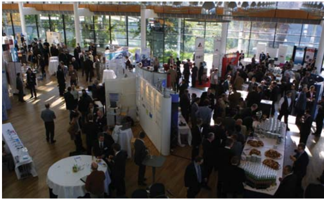
Hardware and Software Exhibition