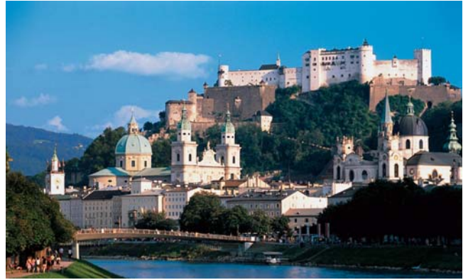
City of Salzburg

Conference registrants can reserve a discounted room rate in hotels in Salzburg by using the congress accommodation booking service which is accessible through http://www.dynamore.de/conference .